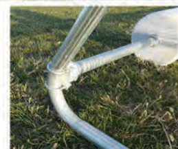
Ballast & Wheel In One!

Easy to move and safe at the same time... Bison No-Tip portable soccer goal packages help facility managers sleep well at night • No-Tip packages meet all ASTM F2056 and ASTM F2673 standards for safety and performance without the use of loose ballast bags or undependable ground stakes that are often forgotten or improperly installed • Extra backstay depth, radii on all square post corners and net attachment that has no hardware • In addition to the No-Tip transport/ballast drums and lightweight aluminum post design, all Bison portable goals feature a unique Torque Tested backstay attachment design and rear backstay spreader bar that allows us to offer an industry-leading eight-year limited warranty that includes typical failure of the vulnerable connection between uprights and the backstays • Goals meet or exceed all NCAA, National High School Federation and FIFA standards and rules • Qwik-Track net attachment system allows net clips to stay connected securely to the net when net is removed from goal • No loose fasteners, Velcro straps, welded hooks or screw-on net clips are necessary • Extra thick textured white powder coat finish • Backstays are galvanized • All ShootOut goals are sold in pairs • See chart at right for goal size options