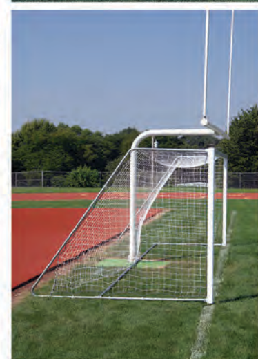
Football Field Compatibility