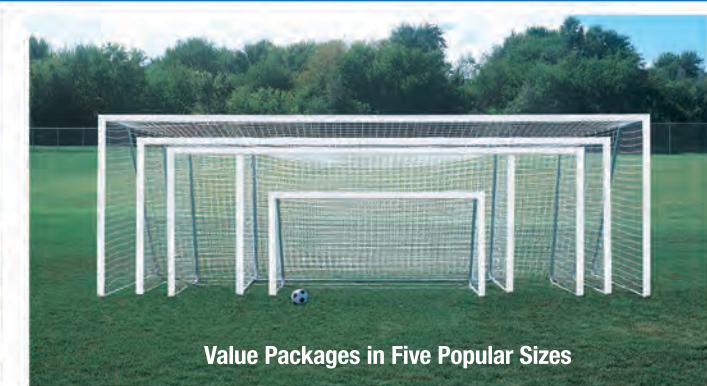
Value Packages in Five Popular Sizes

Value Packages include goals, auger style hold downs, rear stabilizer bar and QwikTrack net attachment kits (nets and transport kits sold separately). All Value Packages meet ASTM F2056.