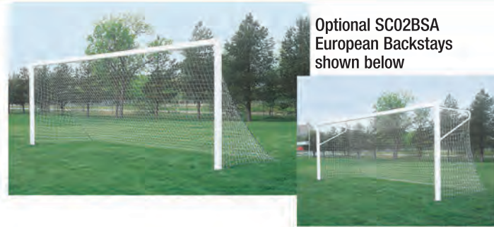
Optional SC02BSA European Backstays shown below