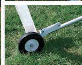
No-Tip (top) and Tip & Roll Transport Kits Available