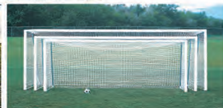
No-Tip Packages in Three Popular Sizes